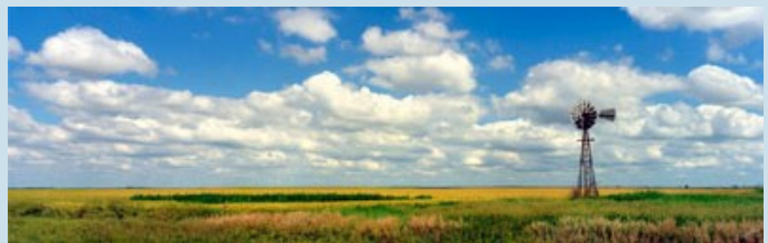
(IMAGE CREDIT: George Jerkovich, Near Nicodemus, c. 2000, archival inkjet print, 11 7/8 x 35 7/8 inches, Courtesy the artist. © George Jerkovich.)

Opening reception: 2:30 p.m., Sunday, March 25, Central Library, 223 S. Main Exhibit typically available during business hours, Saturday, March 24, through Monday, April 30, Central Library, 223 S. Main