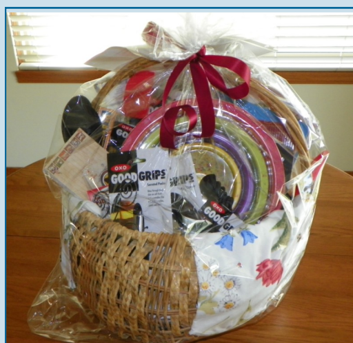
WALA donated a "Cooking With WALA" basket to the Kansas Library Association Education Foundation (KLAEF) fundraising raffle.