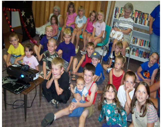
The best audience in the world. Medicine Lodge Library