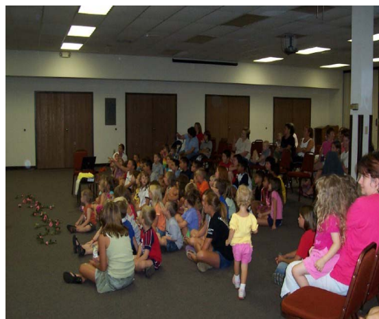
Medicine Lodge Library