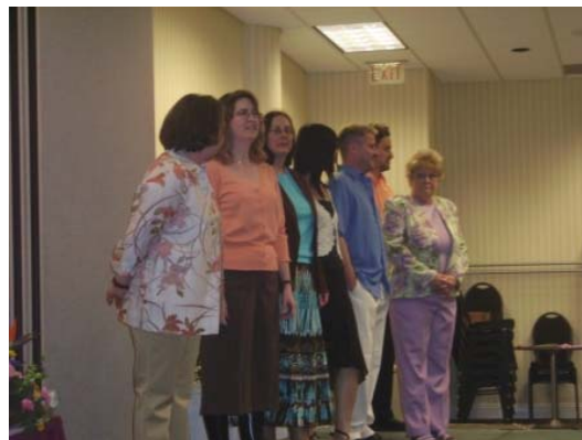
The WALA Fashion Show team at Tri-Conference.