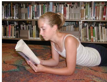
A Club Read reader (young adult summer reading program).