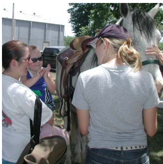
Family Library Day: Meet animal friends with Harvey County 4H-ers