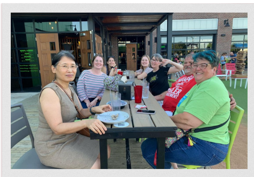
August Singo Summer Gathering at Chicken n Pickle in Wichita, KS