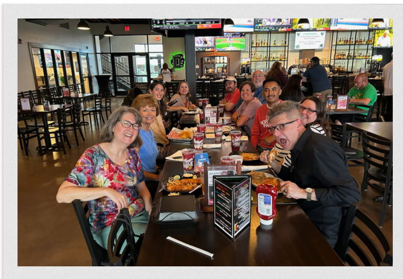
September Meet & Greet at the Sandbox in Derby, KS